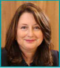
Zoë Metcalfe Police, Fire and Crime Commissioner for North Yorkshire