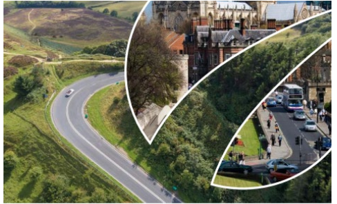
York and North Yorkshire Road Safety Partnership Safer Roads Strategy 2021-2026