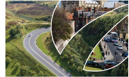
York and North Yorkshire Road Safety Partnership Safer Roads Strategy 2021-2026