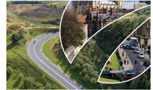
York and North Yorkshire Road Safety Partnership Safer Roads Strategy 2021-2026