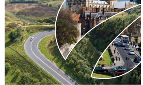
York and North Yorkshire Road Safety Partnership Safer Roads Strategy 2021-2026