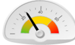
Killed Seriously Injured Casualties