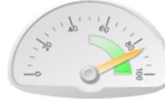
% Victims Satisfied