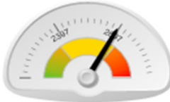
Victim Based Crimes recorded