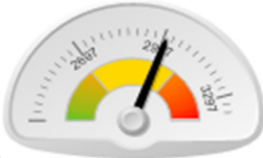
Total Crime Recorded